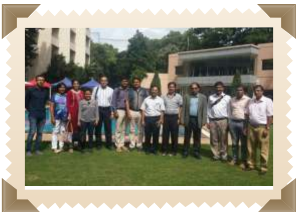
Organizing Committee with Central Inspection Team