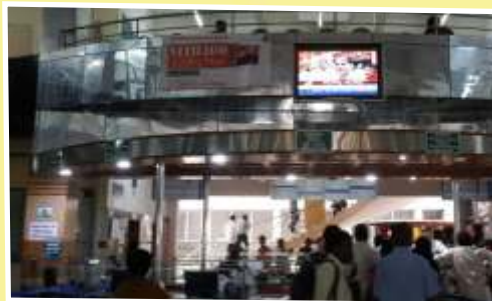
Bengaluru- Rajarajeshwari Medical College and Hospital