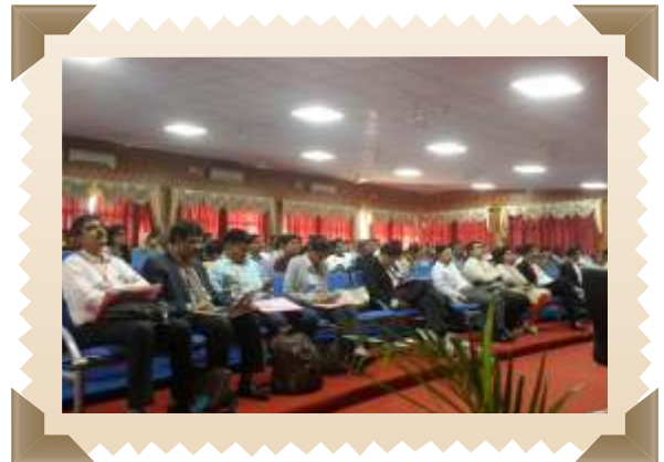
South Zone Dermatosurgery Workshop - Packed hall till the end