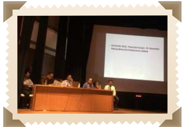
CC Meeting Where major decision were taken