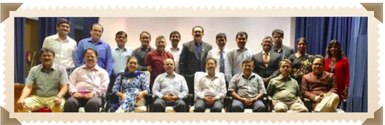
CC Members Participated, Navi Mumbai