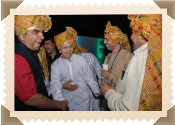
Organizing Committee in ethnic dress code