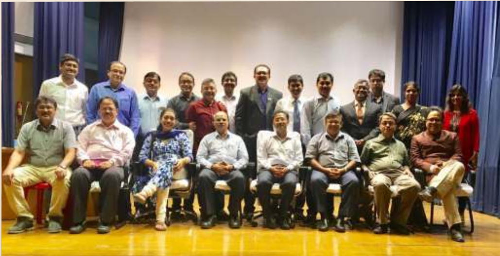
Central Council Committee