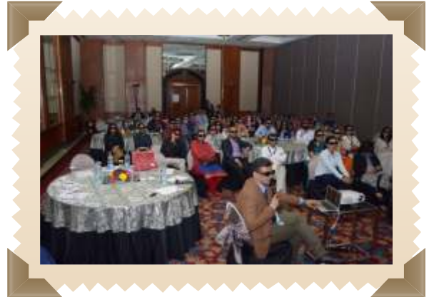
Delegates keenly observing the 3 D video demonstration