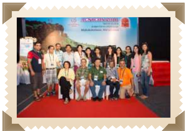
The dress code for the delegates & faculty too (smart & summer casuals for academics, traditional for banquet) was a super hit with all. Probably the first of its kind in an Indian Dermatosurgery Conference!