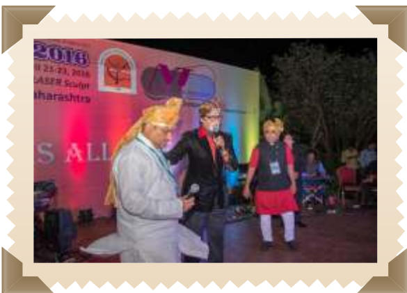
Cultural evening during Banquet