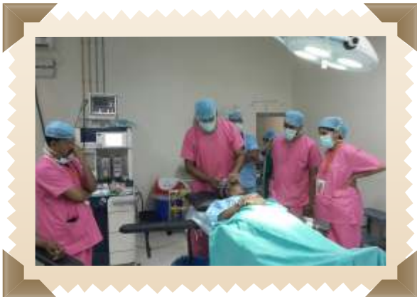
Anesthesia Blocks - Demonstrated by anesthetist