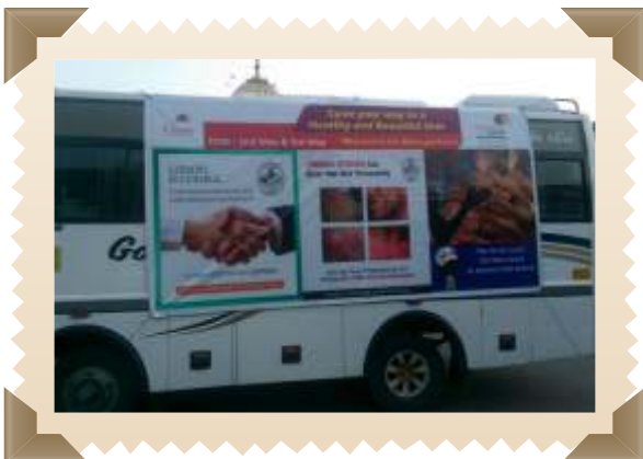
DERMABUS- taking message of 'skin care' to public-2nd May 2017