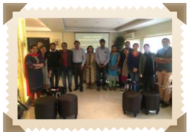
Organizing team with faculty