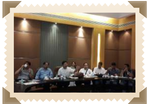
WCOCD 2017/ ACSICON 2017 Venue Inspection: Scientific Meeting at Hotel Lalit Ashok