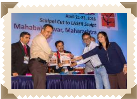
The Award Paper session, ACSI innovation award & free paper sessions showcased the immense talent of our Indian Dermatosurgeons!