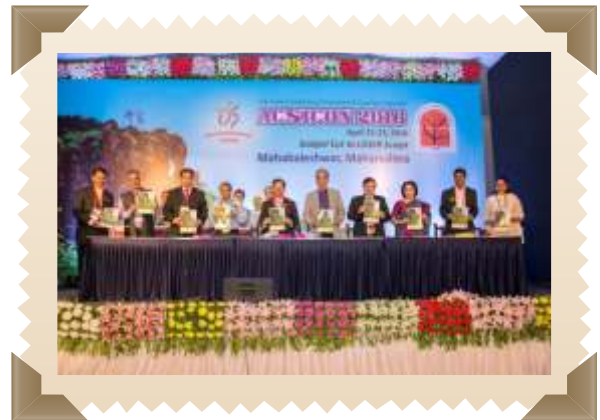
Releasing ACSIPEN 2016