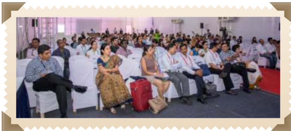
Main hall packed with delegates throughout the conference due to interesting lectures