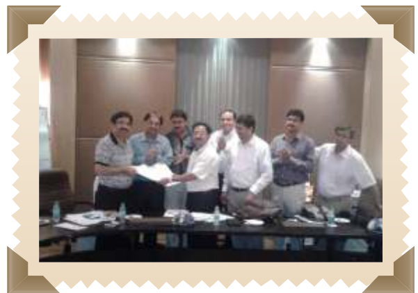
Legacy continues - MoU signed