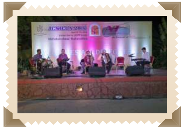
Going by the theme of the conference - 'academics with fun & frolic' a memorable gala dinner and banquet at the lovely MPG club.