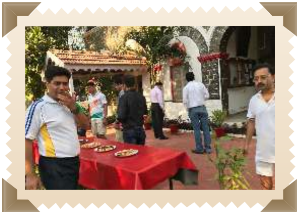
Morning breakfast before CC meeting at beautiful lawn