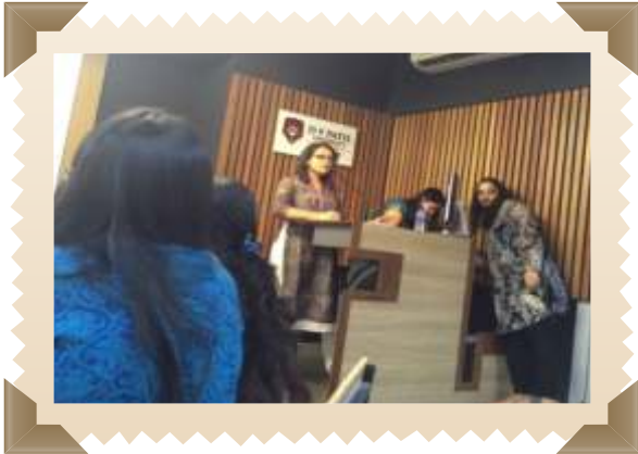
ACS(I) WCOCD DRL International Dermatosurgery Quiz Ahemedabad