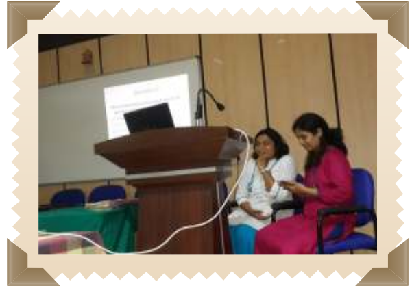
ACS(I) WCOCD DRL International Dermatosurgery Quiz Bengaluru