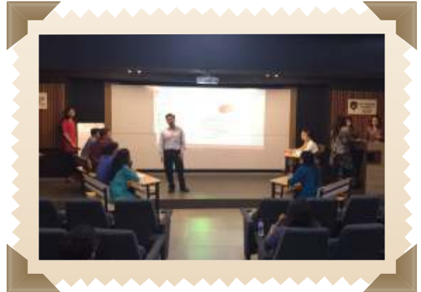
Zonal level held during west zone workshop