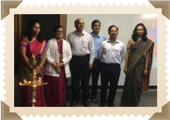
Inauguration of the workshop