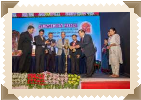
Inauguration -ACSICON 2016

The scientific programme was of a very high standard and had focussed sessions on ulcers, nail,ear,acne, antiageing, periorbital rejuvenation, advanced surgery. All the scientific sessions had a very good response from the delegates in all 3 halls. The sessions started right on time & finished in time too. A big thanks to all the speakers for that!