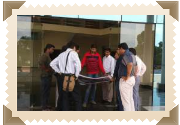
WCOCD 2017/ ACSICON 2017 Venue Inspection