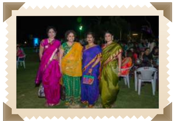
Organizing committee in traditional dress