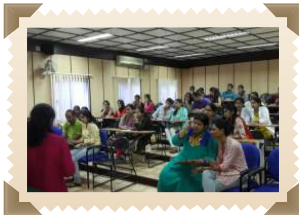
ACS(I) WCOCD DRL International Dermatosurgery Quiz Bengaluru