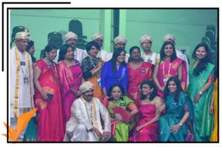
Derma talent was organized where local organizers dermatologists featured their various talents.