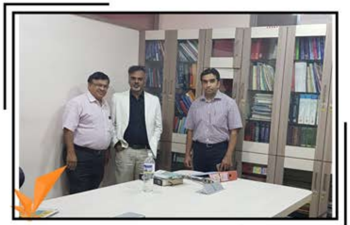
Library Facility at Skin City