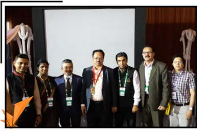
The New ACS(I) Executive elected during the AGBM