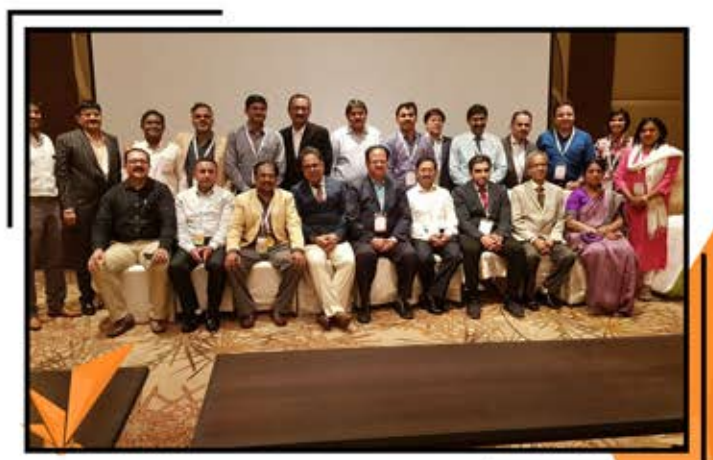
Central Council Members with organisers of ACSIZONE South