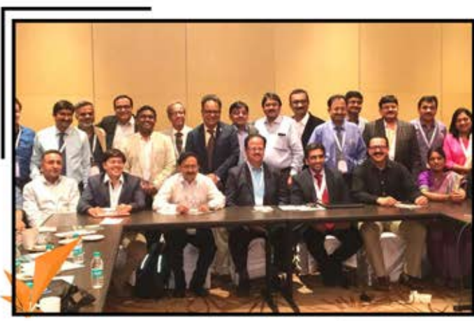
Central Council Meeting at Chennai