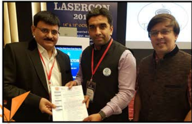
MOU of ACSICON