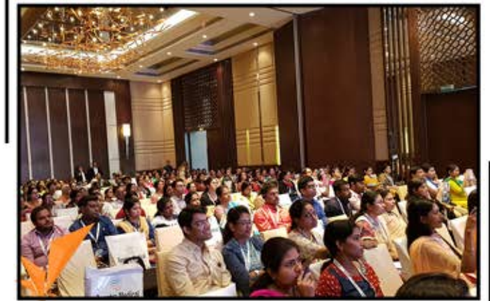
Attentive Delegates at ACSIZONE South