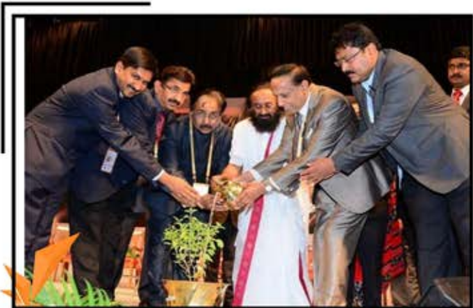
As a green initiative programme, the congress had planned, planting of saplings around Bengaluru.