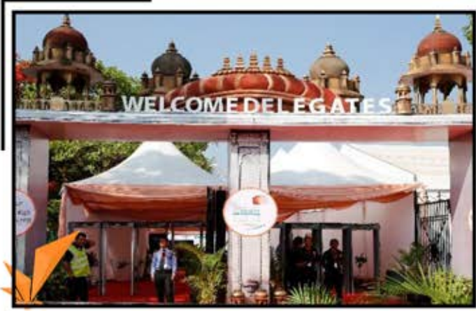
The grand entrance to the WCOCD