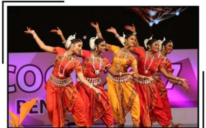
Traditional Dance during the Inauguration Program