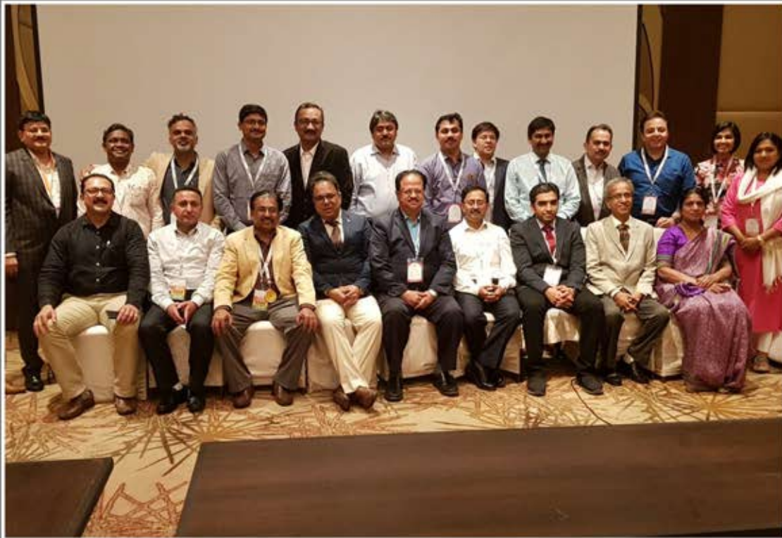
Central Council Committee