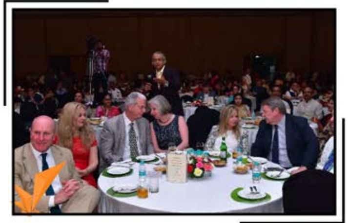
International Faculty enjoying the Indian Hospitality