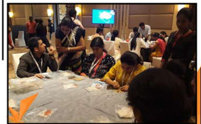
Well arranged workshops