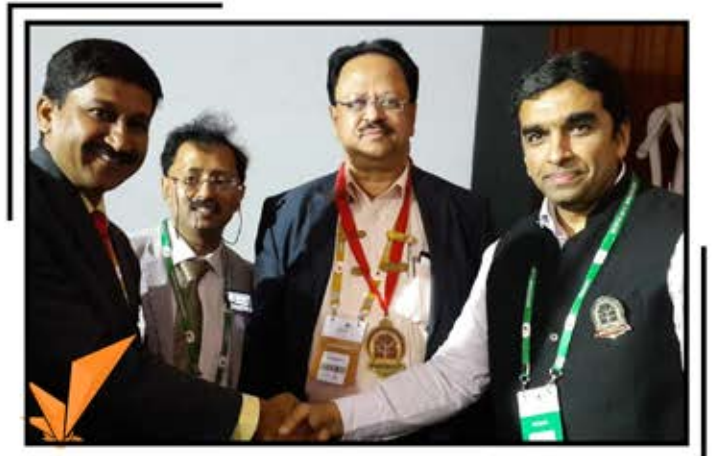
Exchange of the Batons of Hon. General Secretary during the AGBM