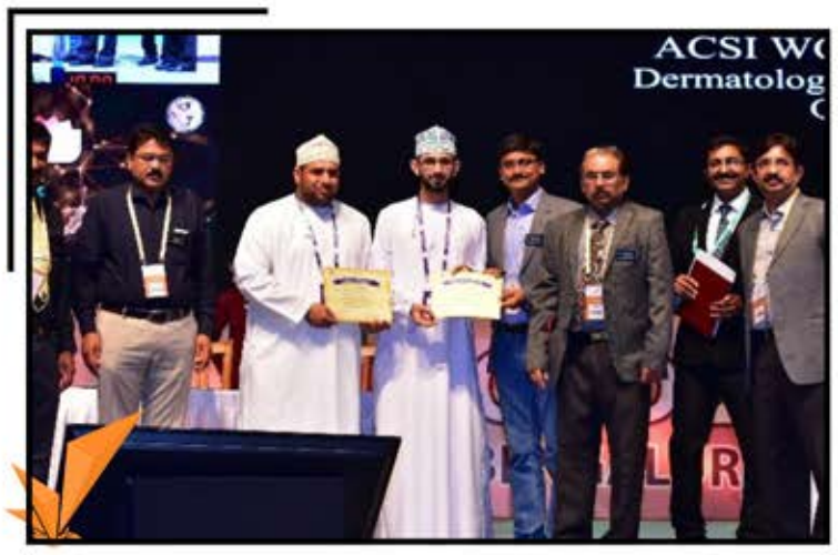
ADDQ Dermato surgery Quiz during WCOCD. First time international quiz was organized.