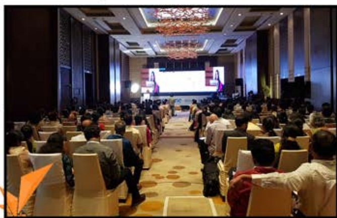
Delegates in the main hall