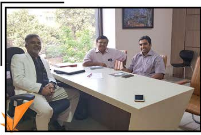
Skin City Inspection for Observership