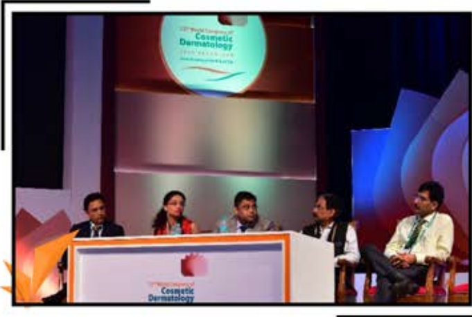
Well Organized scientific sessions