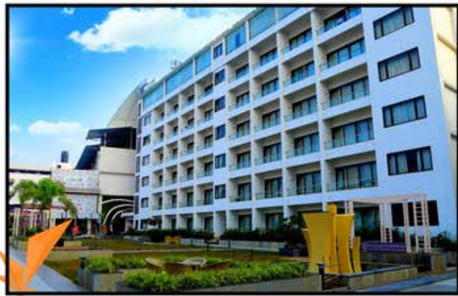
Mirasol Resort, Daman, Venue for ACSICON 2018.