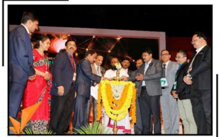
Inauguration at the Hands of Shri Shri Ravi Shankarji