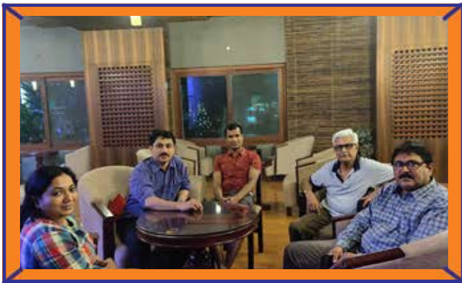
ACSICON 2021, Wayanad venue inspection