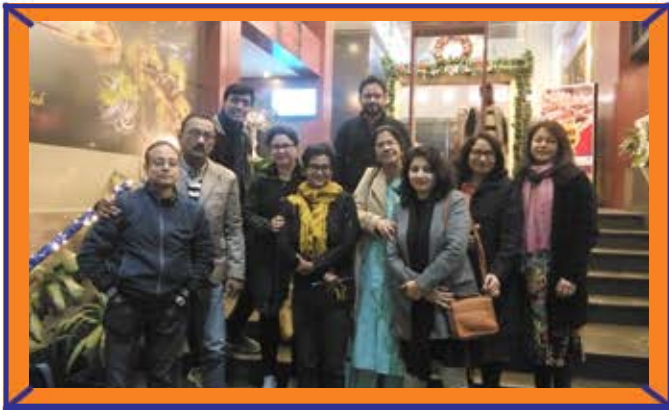
Team ACSICON 2020, Guwahati