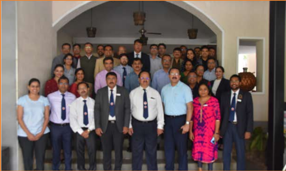
Central Council Committee